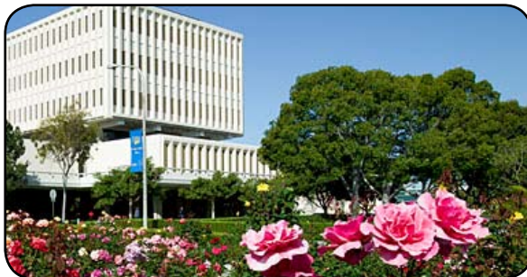
The Laurel L. Wilkening Rose Garden at UCI

They have been able to enhance the spatial and temporal resolutions of the precipitation estimation over the southwest more accurately. Some specific deliverables by UCI team include: